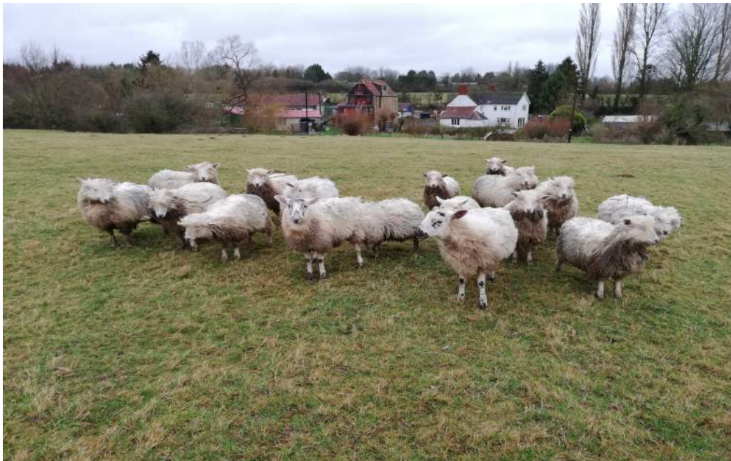
Happy sheep on LACO6, west of A350 (14 Jan)